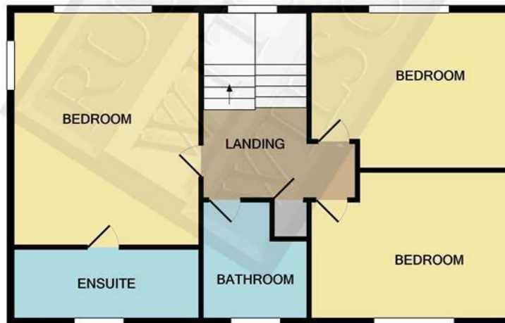
1ST FLOOR APPROX. FLOOR AREA 642 SQ.FT. (59.7 SQ.M.)

TOTAL APPROX. FLOOR AREA 1296 SQ.FT. (120.4 SQ.M.)