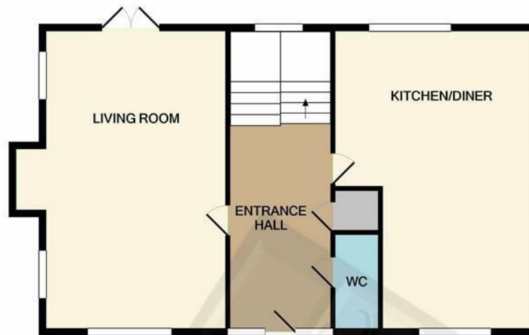
GROUND FLOOR APPROX. FLOOR AREA 654 SQ.FT. (60.7 SQ.M.)